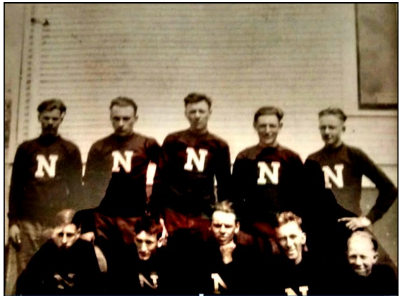
NORMANNA BASEBALL TEAM

Any resident interested in an absentee ballot may obtain an application by contacting the Clerk at ehan-son5@d.umn.edu or 626-5162 or absentee ballots maybe cast in person by appointment with the Clerk. The Clerk or designee will be available at the town hall on Saturday, March 7 from 10 a.m. to noon for anyone seeking an absentee ballot. March 9th is the last day to apply for general absentee ballots.